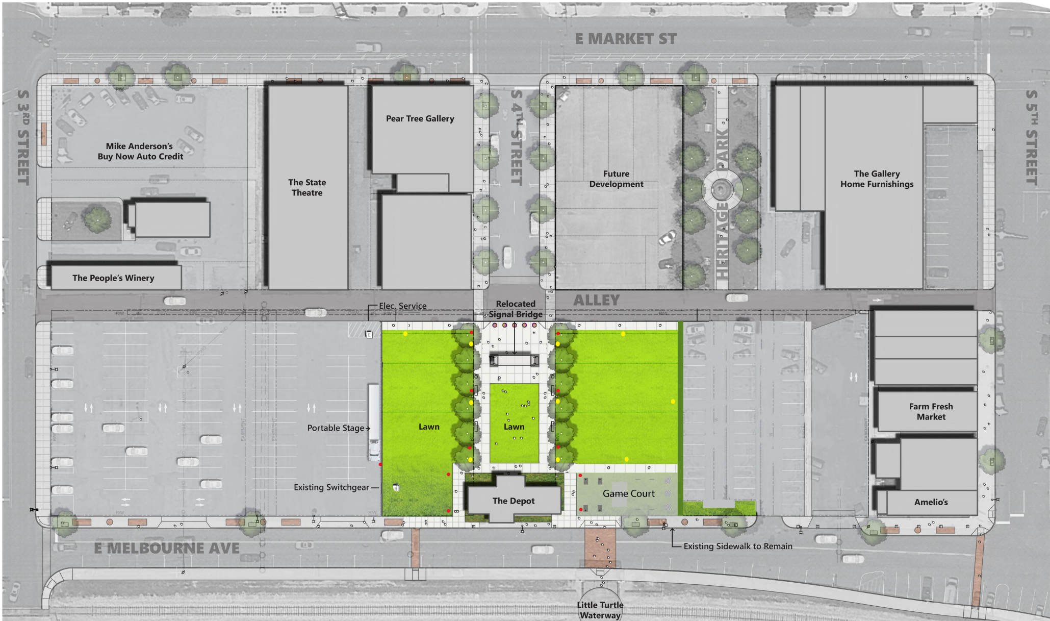
The Commons at Little Turtle Waterway | Logansport, IN Phase 1 Schematic Site Plan |